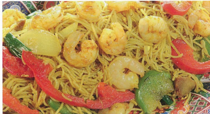
(All pictures used are for illustration purposes only.)